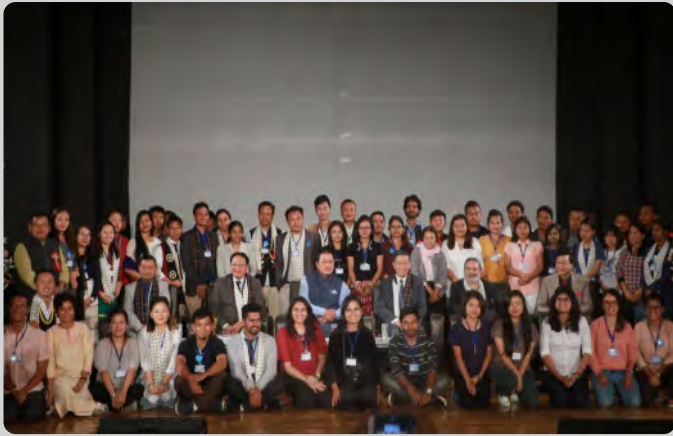
Sustainable Development Summit-VI 2017