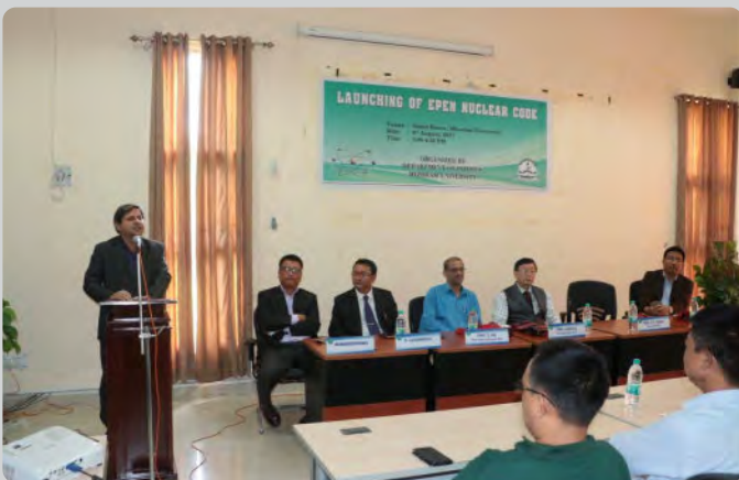
Launching of EPEN Nuclear Code