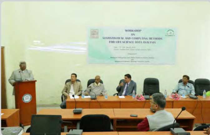
Workshop on Statistical and computing Method