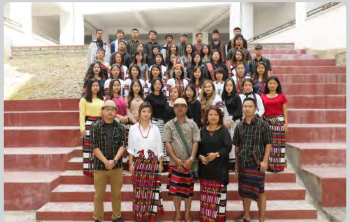
Traditional Dress Day