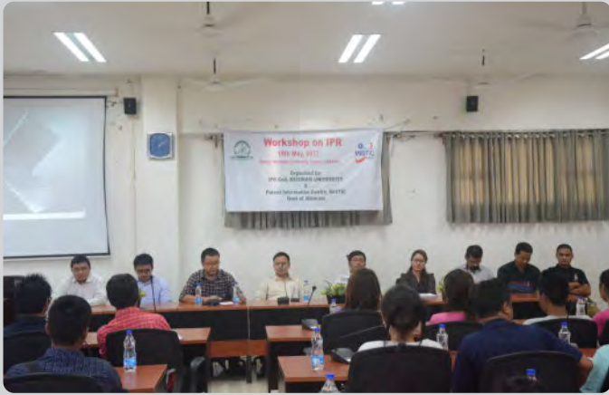
Workshop on Intellectual Property Right