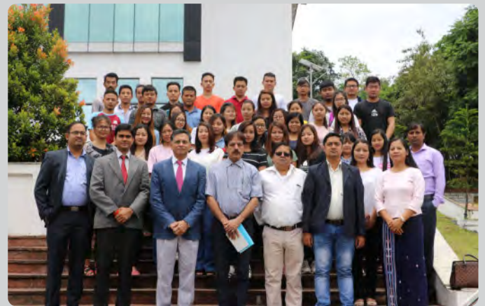
Seminar on Skill & Entrepreneurial Development