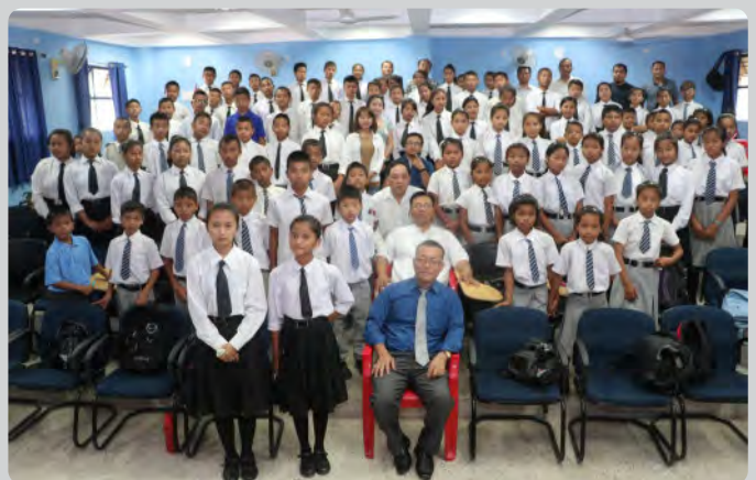
Career Counseling-Organised by NSS Cell