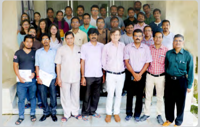
GIANT International Workshop 18.8.2017