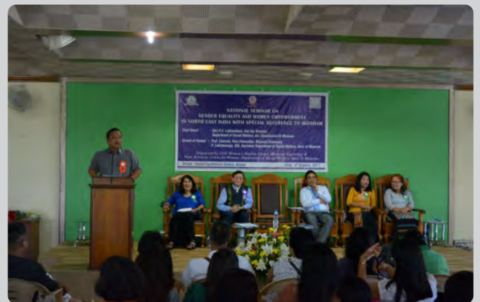
National seminar on Gender Equality