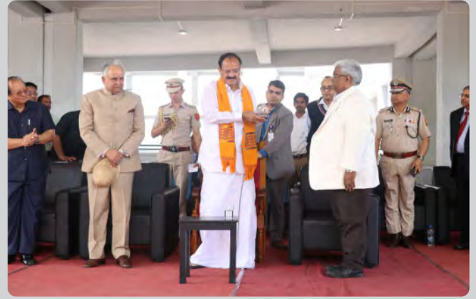
Honorable Vice President of India M. Venkaiah Naidu visit Mizoram University