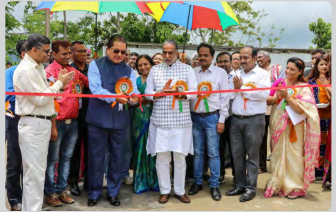
Inauguration of Centre for Disability Studies, MZU