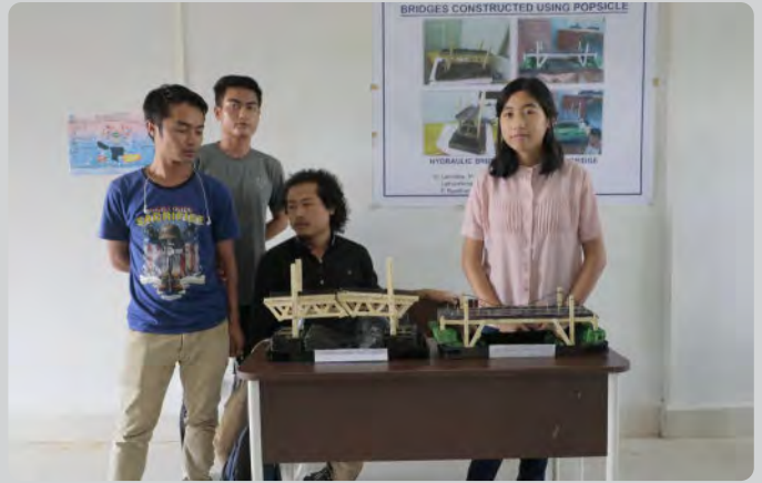
Zo-tech Fiesta 2017