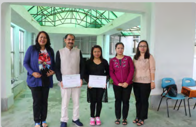
Best Library User 2017- Faculty & Student