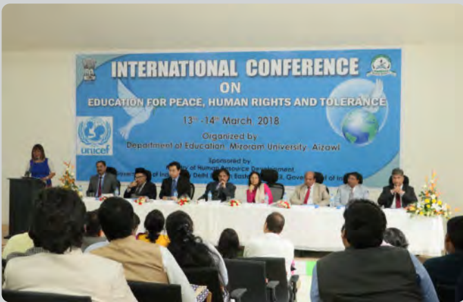
International Conference on education for Peace, Human Rights & Tolerance