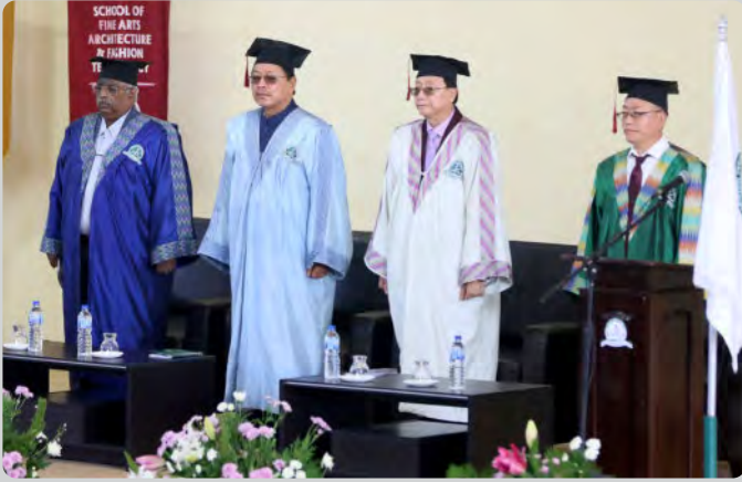
12 th MZU Convocation 2017