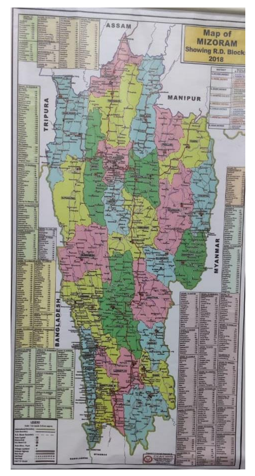
Appendix 4: Mizoram Political Map