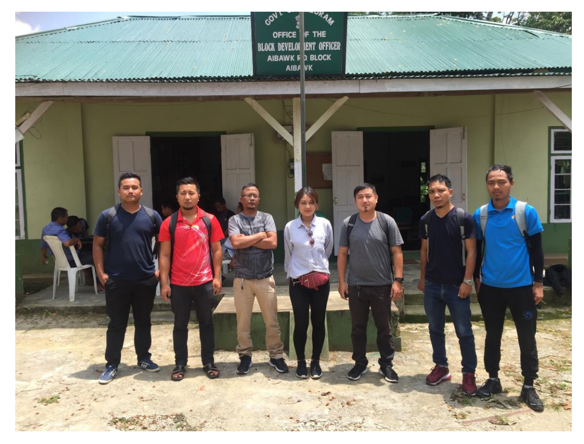
Interactive Session with BDO & Staffs at Aibawk RD Block on May 12, 2019.