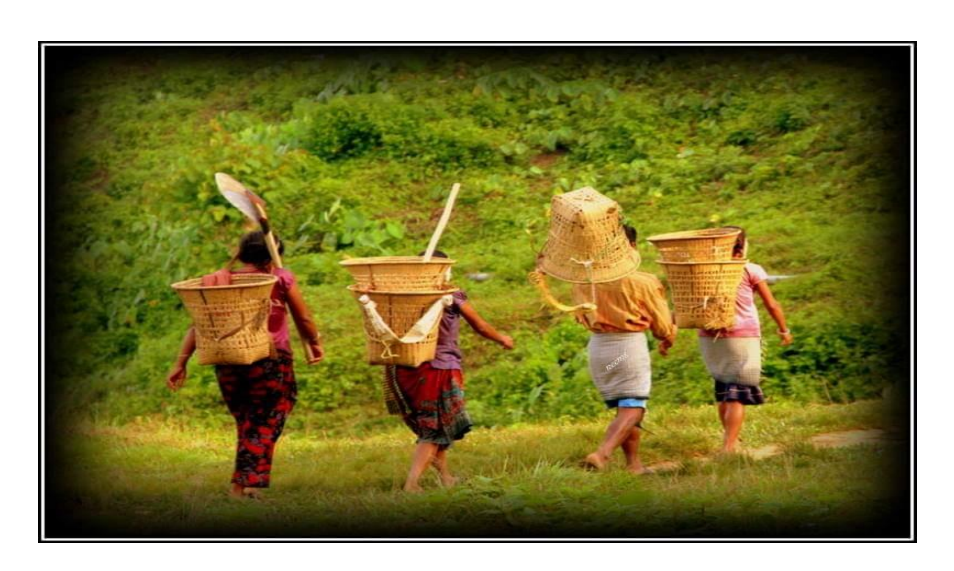
Figure (ii): The laborious working Bru people.

The Riang are laborious and hardworking people. Their strength in carrying head-load is also noteworthy. They are kind-hearted and straightforward. They show affectionate and have immense hospitality to their guest. No guest or visitors are given lousy treatment in the Riang house. The Riang are very good in basketry work. They have their artistic skill in designing and decorating works. They also have a particular talent in mat making too. Carpets made out of bamboo canes are commonly used by them as well as by the Mizo for drying paddy in the sun. <sup>92</sup> However, due to less demand and the average prices, one could only work as profession. They only make their articles on leisure time, usually when they are off from their daily jhum wok.