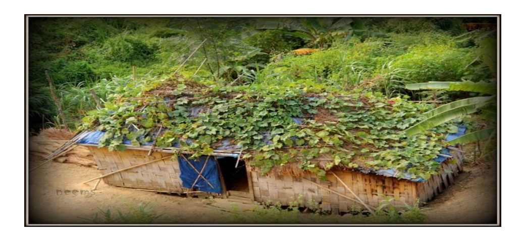
Figure (iii): Typical Bru house of Mizoram.

In their ancient days, they live at a distance and do not live in close contact with their neighboring villages, isolating themselves as much as possible. The Bru after their entry to Mizoram, many of them live and settle in the Mizo villages, where it seems, in order to negotiate into the major society, they have to deal with the living style and manner of the Mizo community. Before, the Bru society was a communitarian, which confined to their respective villages. However, after the coming of Gospel, it brought them together as one community and they have to experience a collective solidarity removing the solitude of different villages, which we are dealing in the next chapter. In the earlier days, the Bru were afraid of each other, the southern Bru were fearful of the northern Bru, as they still practiced the used of black magic, witchcraft etc. Now, that after embracing Christianity and terminating their old belief system they are now free to move wherever they want and hence broken the dividing wall of fear. It also helps them to unite in stronger community.