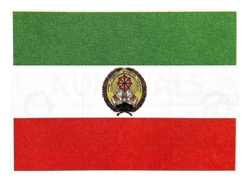
Fig 2.3 Chakma Autonomous District Council Flag<sup>66</sup>

symbolise strong determination, enthusiasm, spirit of working for all round development of the council and the nation as a whole.<sup>65</sup>