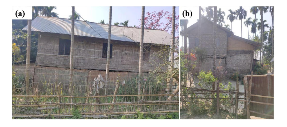
This figure (vii) and(viii) shows the double storeyed house made of bamboo and straw.