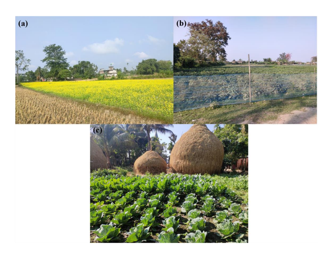
The figure 2.5. shows Graziers cultivation, that besides cattle rearing, the Gorkha Graziers also cultivates crops i.e vegetables, mustard and Paddy, which is called Dhan in local languages.

even women have important role in looking after the cattle, it is because the women started looking after them, male go for a work. They also asserted that beside grazing other occupation are cultivation, farming and smaller business and daily labour wages while the educated look for government jobs like teacher, defence service, and private school teacher'. As far as the protection of Graziers in Assam is concerned the Government, has not taken any policies for the protection of Graziers because of which the number of Goths have decreased.