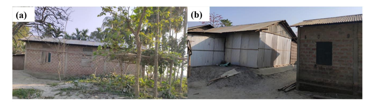
(v) and (vi) shows the pakka house built with brick and stones.

chang <sup>307</sup> house is used for animal shelters such as cow, goat, and buffalo. With a few exceptions, this system has nearly vanished over time. They now prefer the more convenient Assam type, thatched roofed house and, where finances allow, asbestos roof, Pakka houses, and so on. Their houses in the village are furnished simply and lack modern luxuries. People also built a half brick house for an animal shelter.