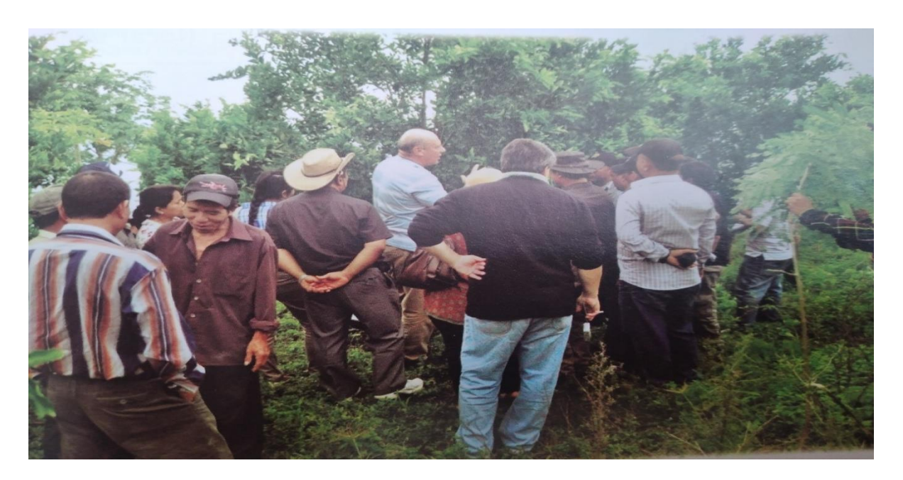
Photoplate No. 14: Training of Department Officers at Orange Orchard, Rulpuihlim