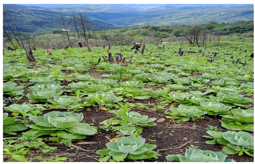
Photoplate No. 8: Lalmuanpuia Sailo's Farm-Cultivation of Off-Season Cabbage under MIDH at Hualtu, Serchhip District