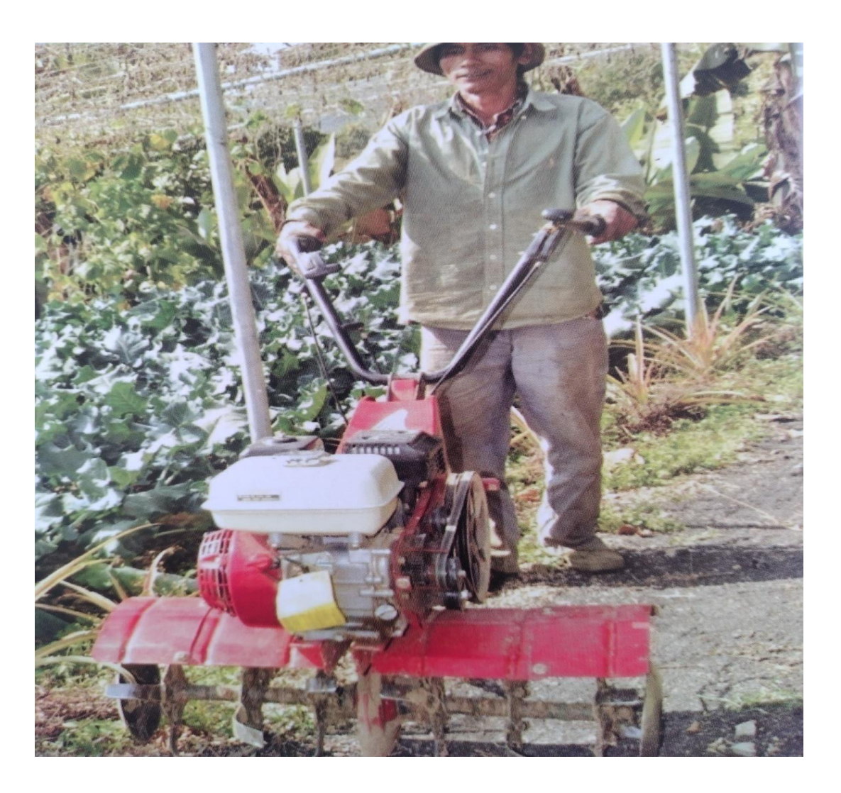
Photoplate No. 12: Beneficiaries of MIDH under the component of Horticulture Mechanization received Power Tiller at subsidized rate