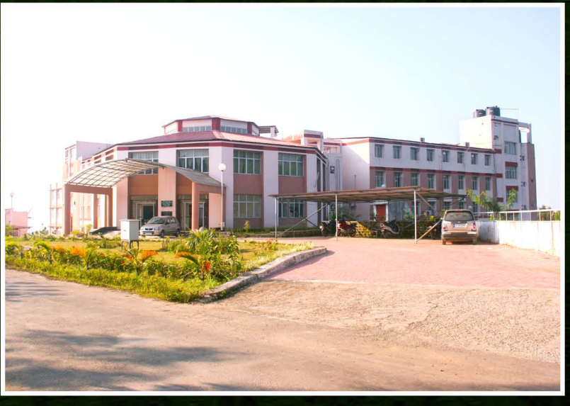
School of Physical Sciences