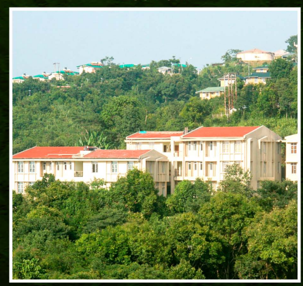
New SEMIS Block