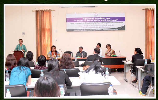
National Seminar on Writers