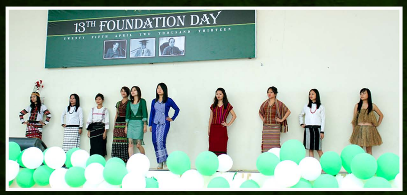
13th Foundation Day