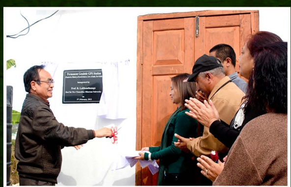
Gedoetic GPS Inauguration