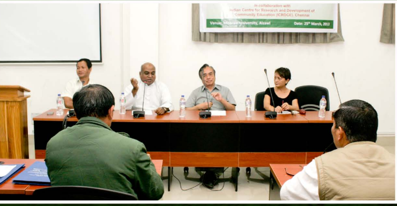
Workshop on Community College