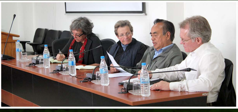
Discussion with Minnesotta University