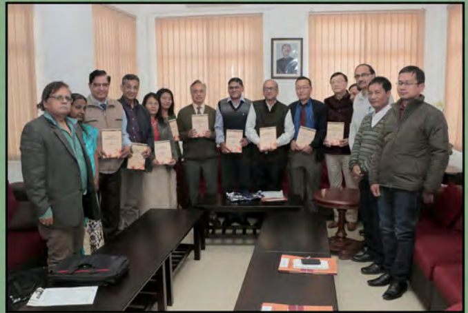
Book Release-Humanities & Social Sciences Journal 2016