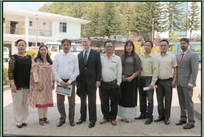
Visit of US Consulate