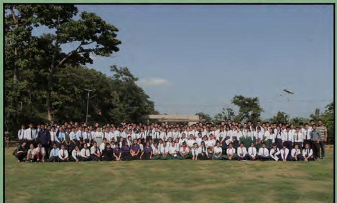
RMSA Students Visit to MZU