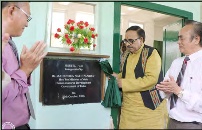
Inauguration of Halls of Residence