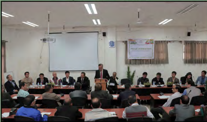
Public Interaction with Parliamentary Delegates of Myanmar