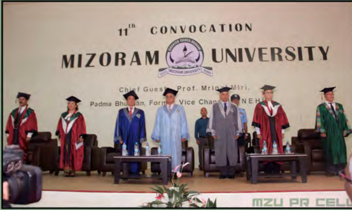
11 th Convocation