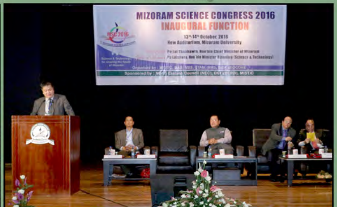
Mizoram Science Congress 2016