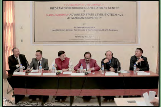
Foundation Stone laying of Bio Resource Centre