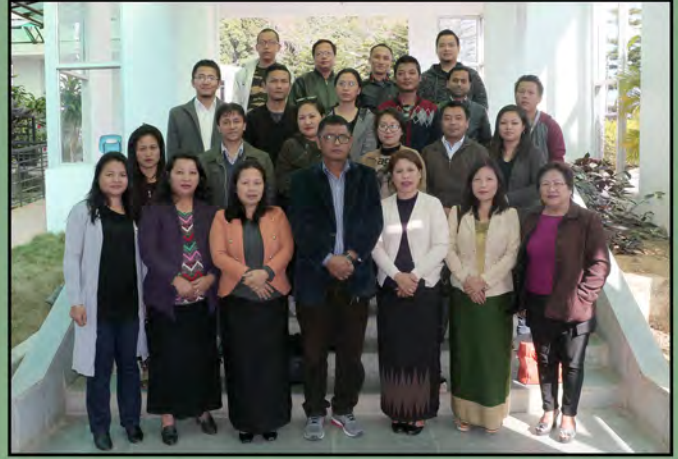
Administrative Staff Training 2016