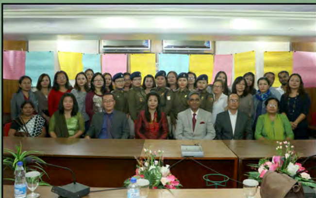
Capacity Building for Women Leaders