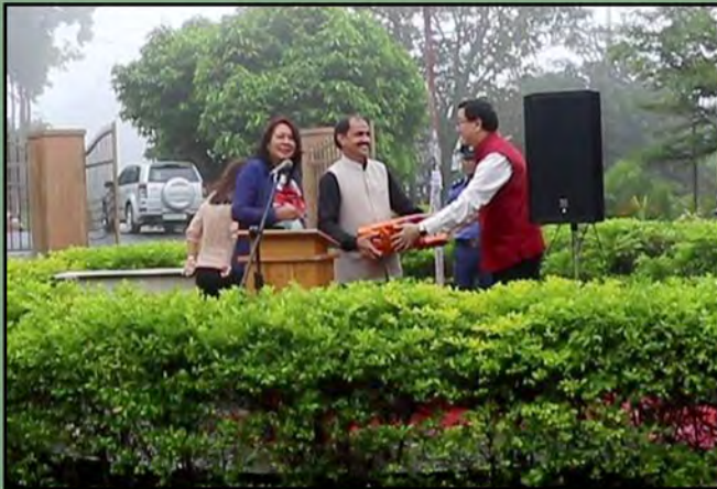
Best Library User (Teacher)