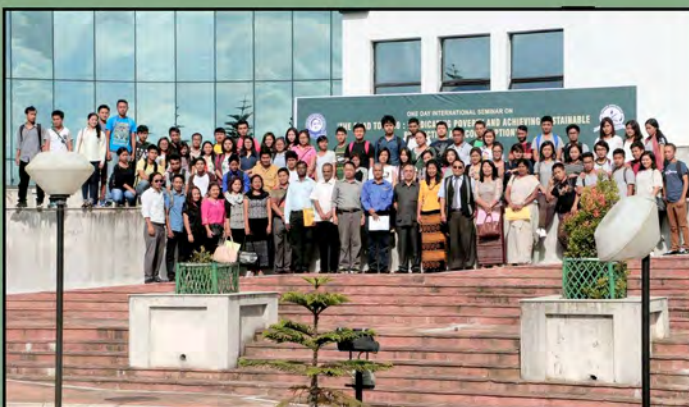
International seminar on The Road to 2030