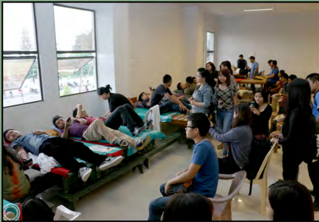
NSS Blood Donation