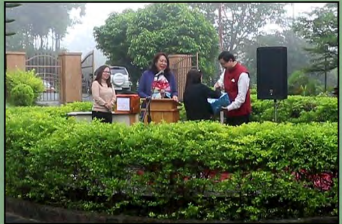
Best Library Users (Student)