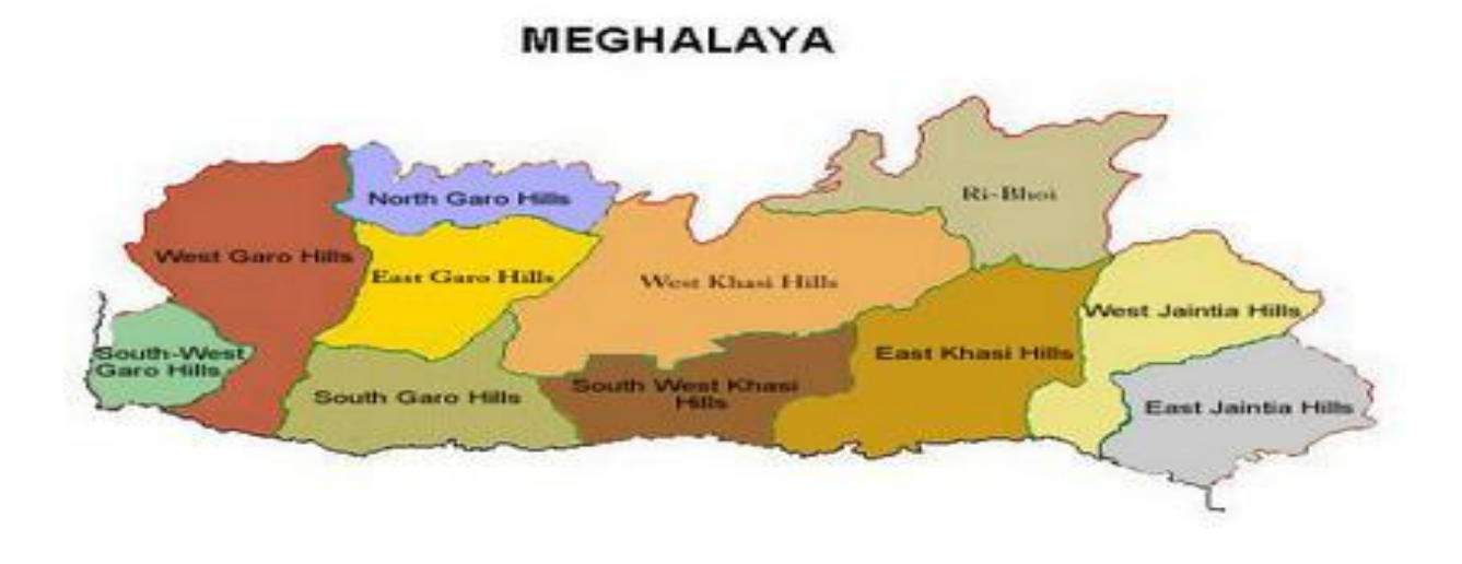
Figure 3.1.1. Map of Meghalaya