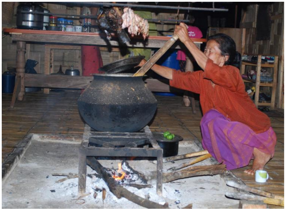
Photograph 2: An elderly Adi woman cooking food