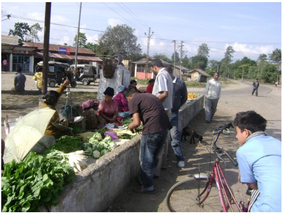
Photograph 7: Women selling vegetables in Pasighat