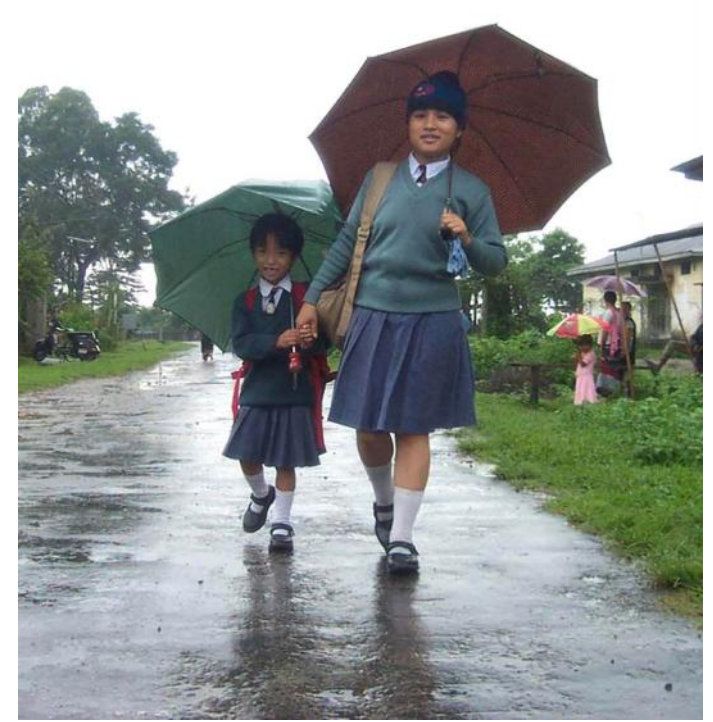
Photograph 9: School girls in Pasighat