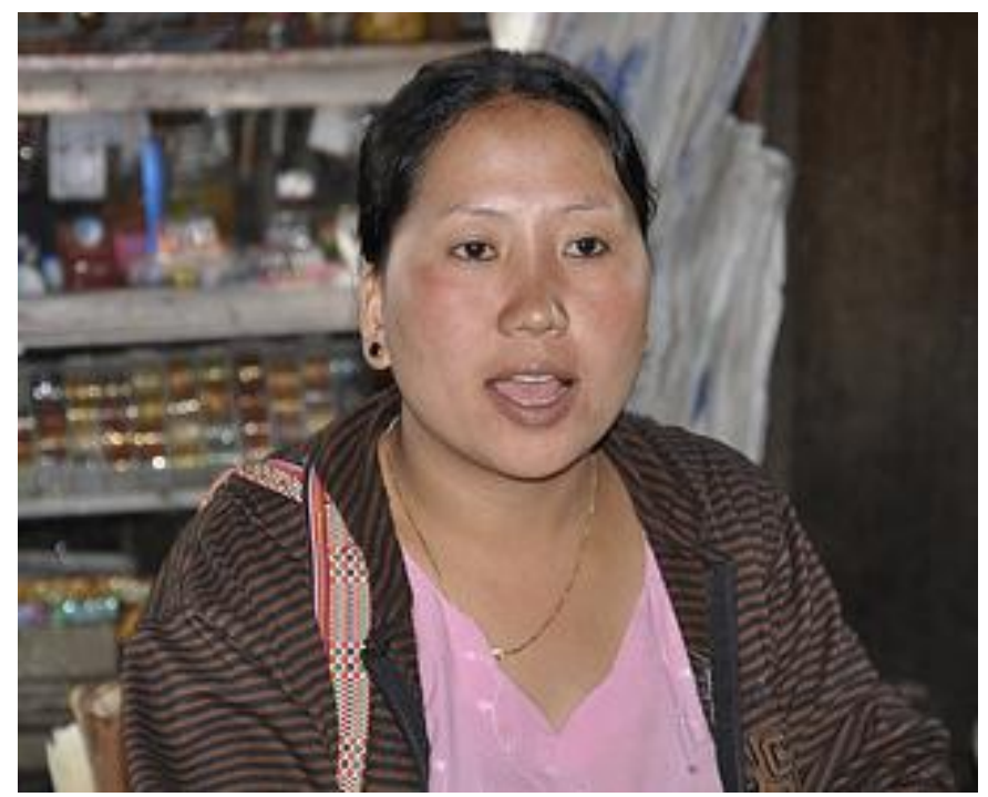
Photograph 10: Apatani shop owner