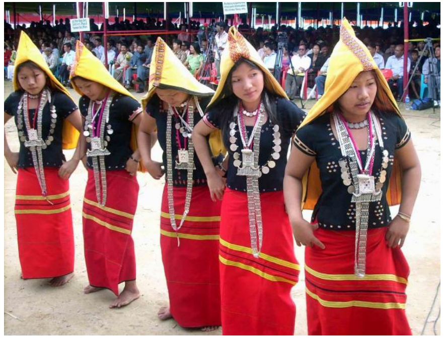
Photograph 5: Adi women participating in a dance