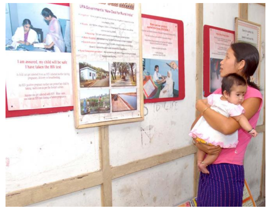
Photograph 6: An Adi woman caring her children to a primary health centre for vaccination