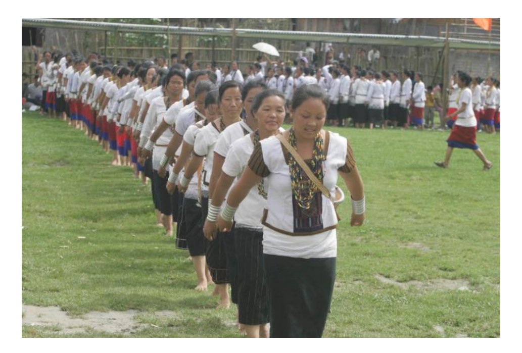
Photograph 3: Apatani women participating in dere festival