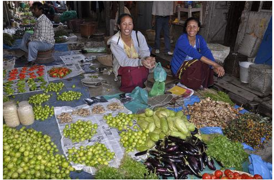
Photograph 8: Women selling vegetables in Ziro