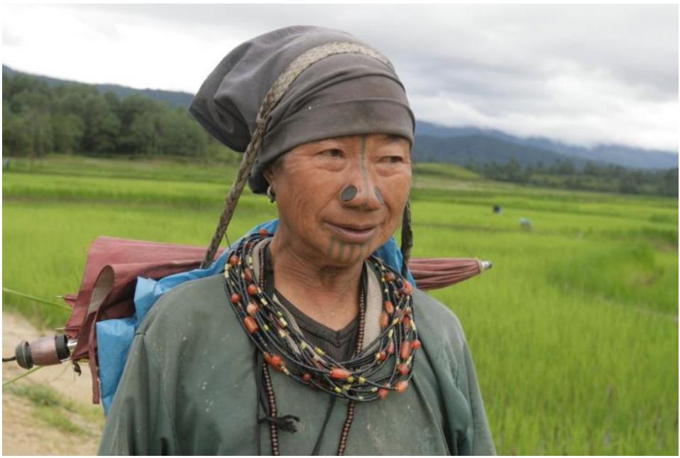
Photograph 1: Apatani woman coming from cultivation