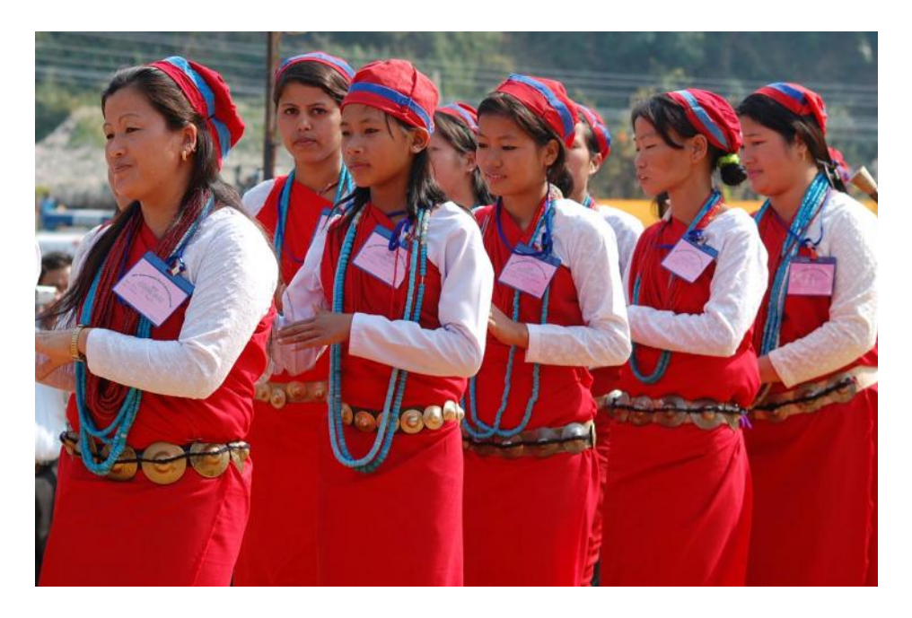
Photograph 4: Tagin girls dancing